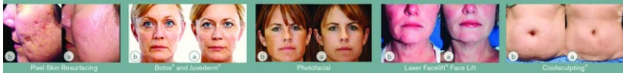
Pixel Skin Resurfacing